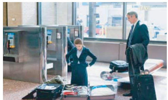
The arrival of Natalie Keener (Anna Kendrick, left) complicates Ryan Bingham's (George Clooney, right) work life in Up in the Air .